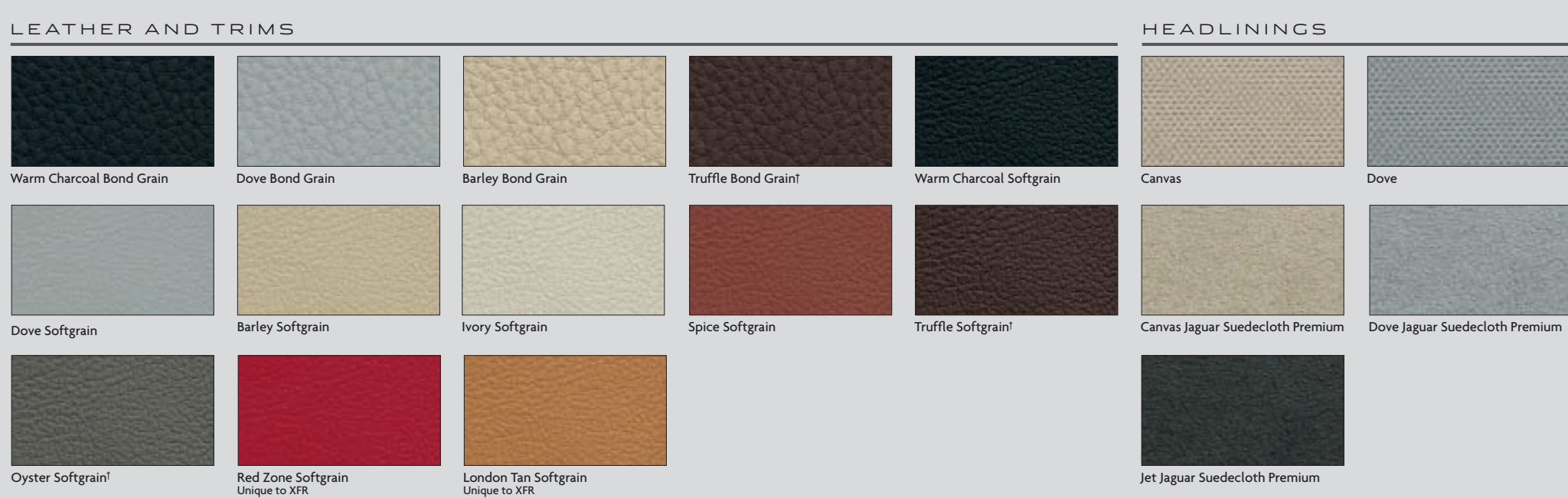
*Metallic paint †Instrument panel upper and door top rolls only For availability by derivative and details of interior/exterior combinations see table on facing page. Actual colors may vary from images shown.